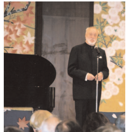
Maestro Masur making his speech