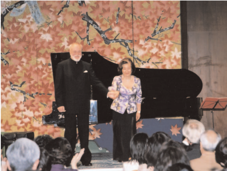
Tomoko and Kurt Masur at their joint appearance at the Gala on 23rd October 2005 in Osaka

Asia welcomed the Masur husband and wife team in October. After a concert tour through South Korea, they both arrived in Tokyo on 22nd October, to promote the Felix Mendelssohn Bartholdy Foundation in the German Embassy there. The clear aim was to assemble a circle of potential Japanese sponsors from all areas of society, art, science, economy and politics, who would also support the aims and tasks of the Felix Mendelssohn Bartholdy Foundation in future.