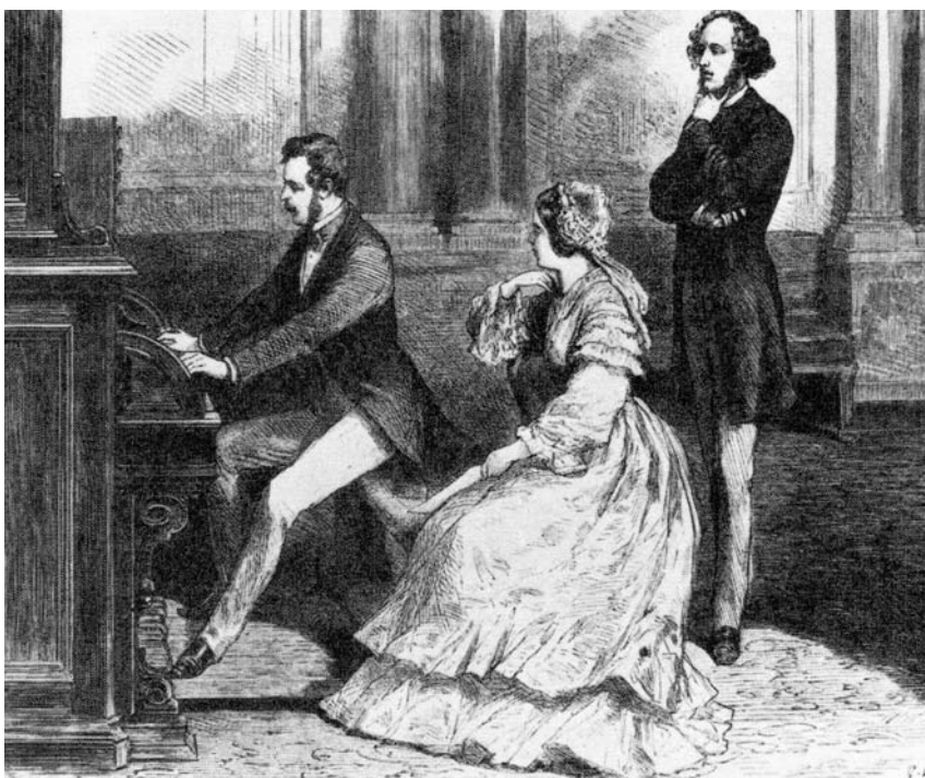
Felix Mendelssohn Bartholdy making music with Queen Victoria and Prince Albert, contemporary drawing, Central Library Zurich

We very much look forward to further flourishing and inspiring co-operation, and above all we wish Wolfgang Tiefensee strength and good fortune in his new and important Federal office.