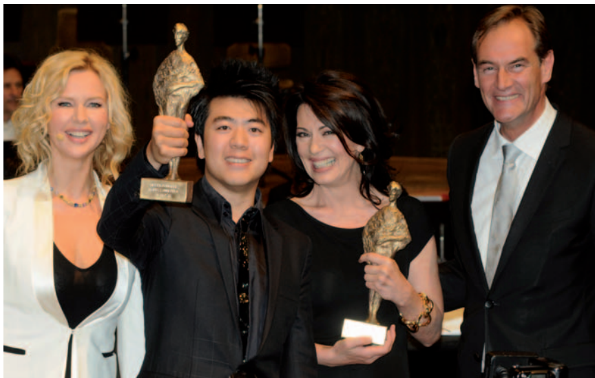
Veronika Ferres (left), the two prize-winners of 2010 Lang Lang and Iris Berben and Leipzig Lord Mayor Burkhard Jung, who as the Chairman of the Felix-Mendelssohn-Bartholdy-Foundation handed out this year's Leipzig International Mendelssohn Prize.

The Lord Mayor Burkhard Jung was able to declare, with satisfaction and gratitude, that the evening had generated a splendid 70,000 euros in donations to the Felix-Mendelssohn-Bartholdy Foundation to support their work in 2010. And he could tell all the guests: The next Gala event will take place during the Mendelssohn festival in September 2011.