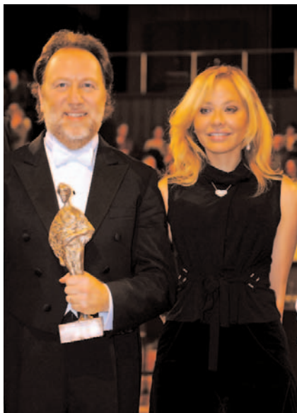
The Prize-winners and their charming "Laudatores": Italian actress Ornella Muti and Gewandhaus Kapellmeister Maestro Riccardo Chailly; Geraldine Chaplin and her artistic colleague Armin Mueller-Stahl with the Leipzig Mendelssohn Prize 2009