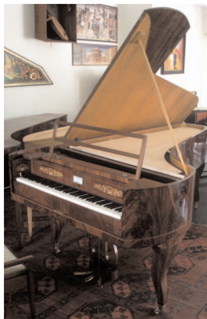
The rare historical piano from the Leipzig Tröndlin workshop; this instrument with its typical 19th century sound could be used also in the salon concerts of the Mendelssohn House in Leipzig