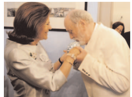
Maestro Kurt Masur – surprised and pleased by the Queen's joke

The first project would be to acquire a comprehensive collection of Mendelssohn first editions, in order to support the Museum's work, and above all research work by the Mendelssohn House and other institutions. This is the largest and most complete collection that has yet been put together, and would particularly enhance research into comparing and completing compositions. Felix Mendelssohn Bartholdy was especially keen on supervising the printing of his works with his publishers in Germany, England or France. Thus, we can find in the first printed editions indications for example of tempi markings and dynamics, according to the composer's ideas. In addition, he – never satisfied – often made further changes, so that different early editions of the same work in France or England can be somewhat bewildering for the present-day user. This is highly important and interesting for researchers.