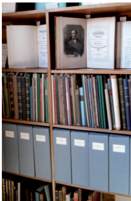
First prints of Mendelssohn's compositions; there are more than 730 printed scores in the unique complete collection – well-preserved and stored in special boxes.